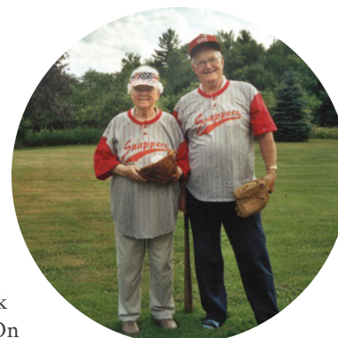
The love for the game continued in their later years.